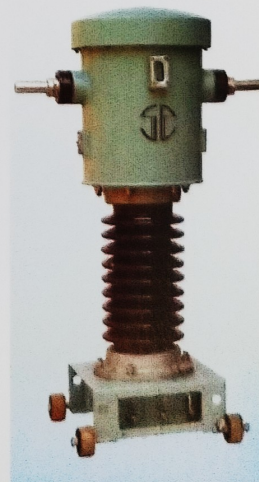
33 kV C.T.