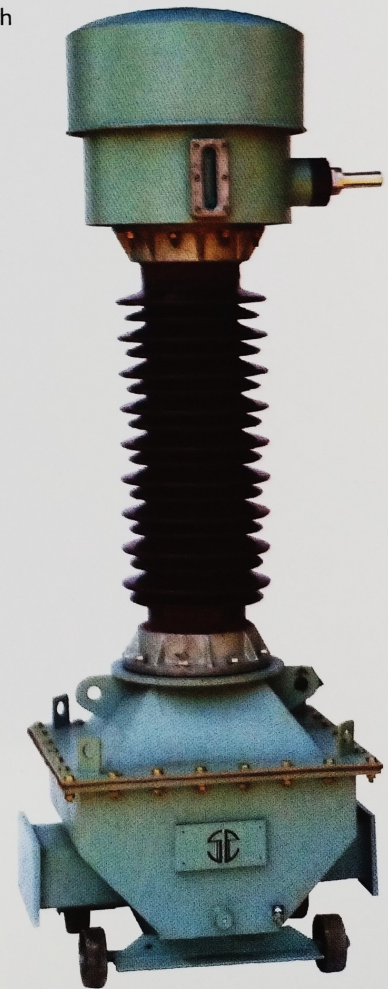
66 kV V.T