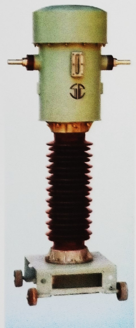
66 kV C.T.