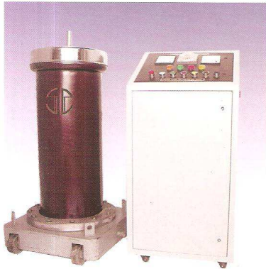
100 kv HVT Set