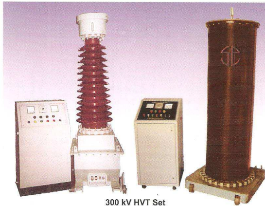
300 kv HVT Set